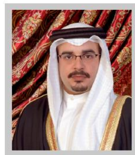
His Royal Highness