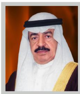
His Royal Highness